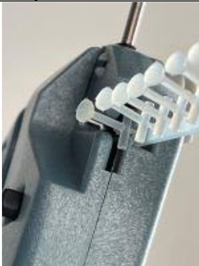
(8) Insert tag strip into the corresponding slots. Push gently until strip stops moving and “clicks”.