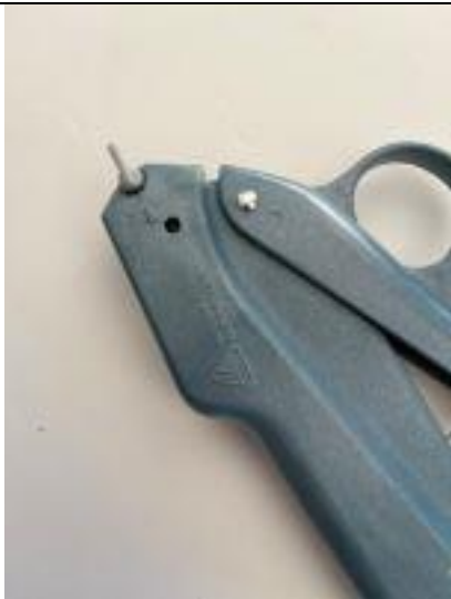
(4) Pull out old needle. START HERE IF YOU HAVE A NEW TOOL.