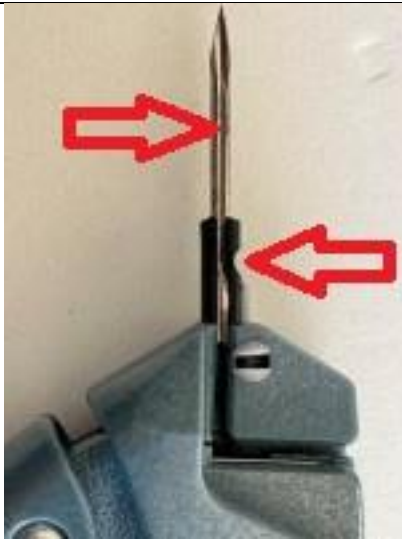
(5) Turn Buttoneer back over. Position new needle: groove facing you; divot on RIGHT.