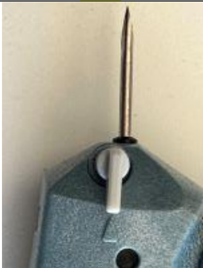
(7) Needle release should be down (locked position) on the opposite side.