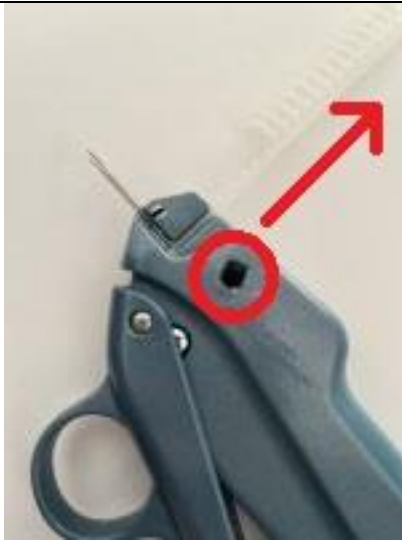
(2) Pull out tag strip while pressing on black tag release button.