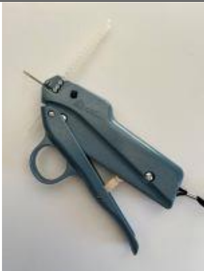
(1) Tags not inserting properly? Might be a bad needle — time for a new one!