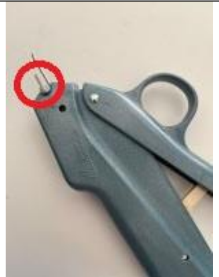
(3) Turn Buttoneer over. Flip UP the white needle release lever.