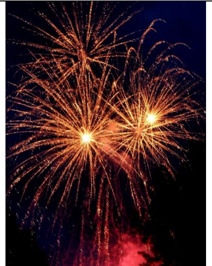
Fireworks! Yay... you did it! 😊